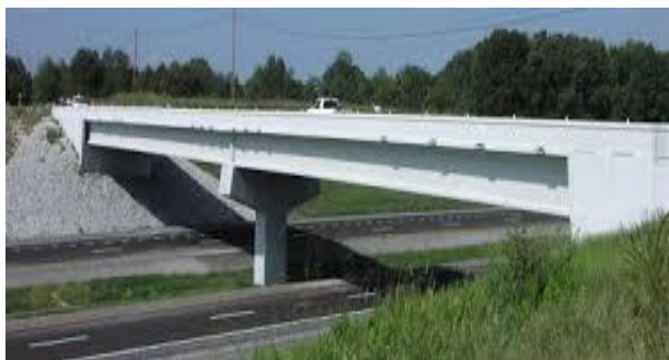
Fig.1 High-performance concrete used in flyovers