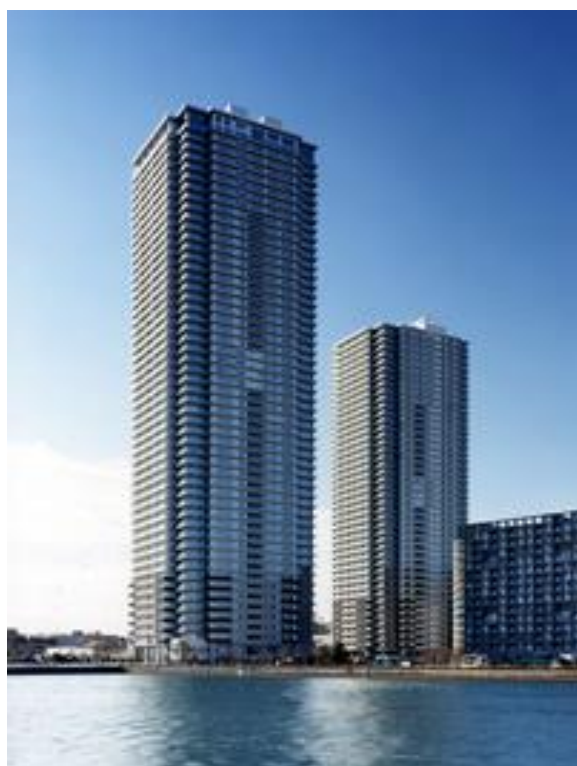
Fig.2 High-performance concrete used in tall building structure

Admixtures plays an important role in the production of High Performance Concrete. Mineral Admixtures form an essential part of the High-Performance Concrete mix. They are used for various purposes depending upon their properties. Table-1 shows different types of mineral admixtures with their particle characteristics.