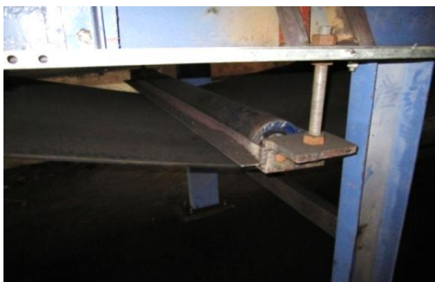
Photograph 3.3 Use of return idler to increase belt tension

iii) During trial it is observed that the belt tension is less and pulleys are revolving ideally. To build the tension one additional return idler is placed on the distance of 30m from tail pulley. Belt is placed below this idler. This idler is clamped on the channel. The vertical movement of the stud allows reducing and increasing the tension of belt. As shown in the photograph 3.3.