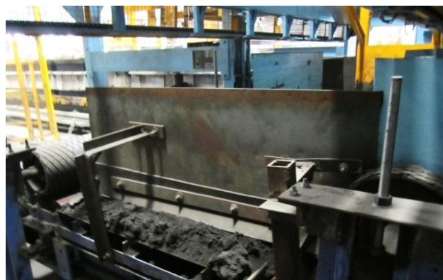
Photograph 3.5 Skirt plate to prevent sand wastage

vi) To avoid the sand wastage the skirt plate is provided near the pressure pulley. As shown in the photograph 3.5.