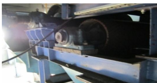
Photograph 3.4 Lifting of snub pulley to increase wrap angle

iv) The snub pulley is lifted up by 20mm to increase the wrap angle between the drive pulley so that the tension at drive pulley is maintained properly. As shown in the photograph 3.4.