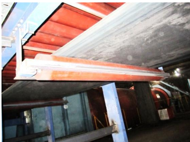
Photograph 3.2: Brackets for return idler

iii) During trial it is observed that the belt tension is less and pulleys are revolving ideally. To build the tension one additional return idler is placed on the distance of 30m from tail pulley. Belt is placed below this idler. This idler is clamped on the channel. The vertical movement of the stud allows reducing and increasing the tension of belt. As shown in the photograph 3.3.