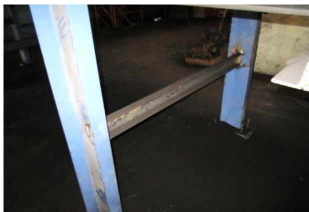
Photograph 3.1: Strengthening of frame structure

i) During the working of the conveyor system, the vibration of frame structure is observed. To overcome this vibration the structure is strengthened by providing (welding) channels between two columns as shown in the photograph 3.1.