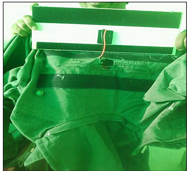
Figure 2 Solar panel attached at the back

The solar panel of 13*5 inches was sealed using glass sheet coating. For attaching the solar panel along with other accessories (circuit as shows in fig 1), a hole of 2*1.5 inches was cut for solar panel and 8.5*8.5 inches was cut for wires inside the jacket. Through the hole, wires and ports were passed into the first layer of garment. Whereas, panel was attached at the back of the jacket using sticky gum, 3 inches below the shoulders as shows in fig 2. The distance 3 inch was selected; because at that distance it has optimum exposure to sunlight and comfortable for wearer. If the solar panel is attached near to the neck, it irritates