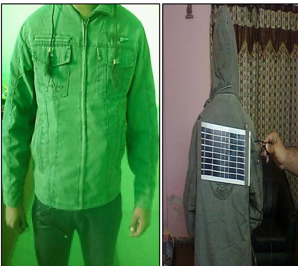
Figure 6 Jacket front and back view

This garment can charge both laptop and cell phone at a time (see fig 8 and 9). The wearable charging garment charges the cell phone in the same time as the normal charger does i.e. 1 to 1.5 hours. For charging any of the devices such as cell phone, laptop, mp3 player, iPod etc, the wearer need not to stand under the sun continuously. There are rechargeable batteries attached in the circuit which store the electric charges and use in the absence of sunlight.