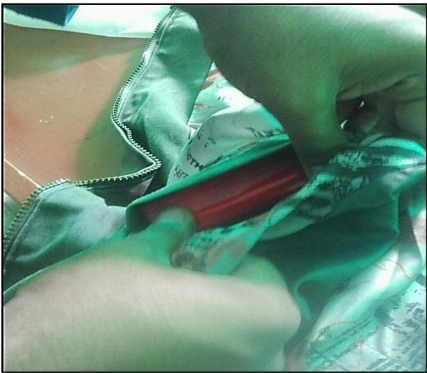
Figure 5 Rechargeable batteries