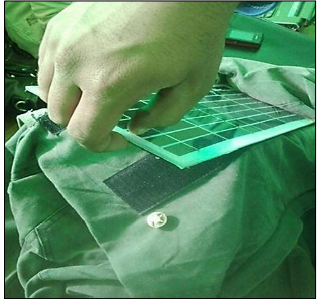
Figure 7 Detachable solar panel