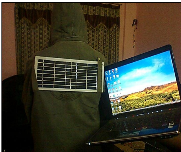
Figure 9 Laptop being charged by solar jacket