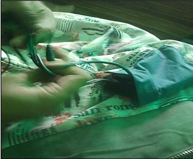
Figure 4 Cell phone and laptop charging pins