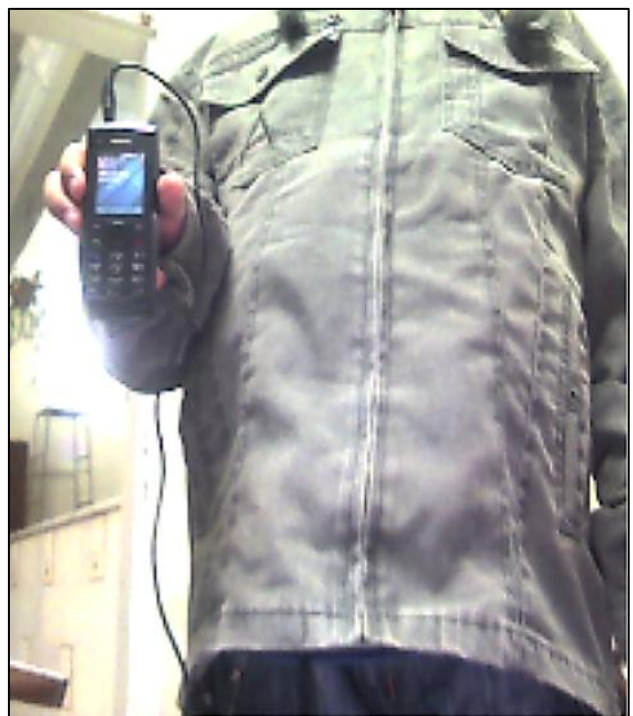
Figure 8 Mobile being charged by solar jacket